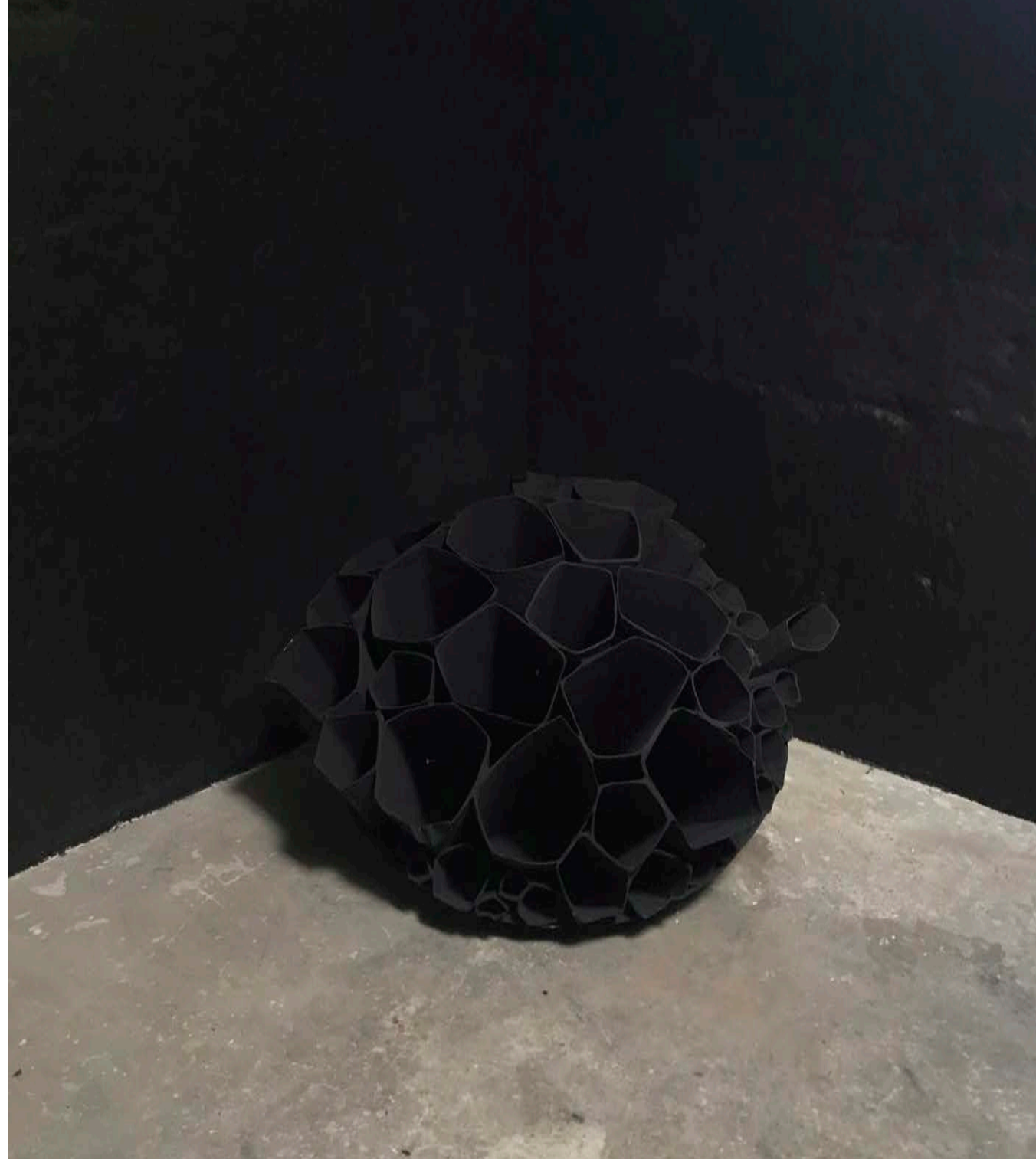
Richard John Forbes CODEX IN INCLUSION 2017 Spanish plaster, latex & black pigment 1500 x 15000 x 700 mm R42.000,00