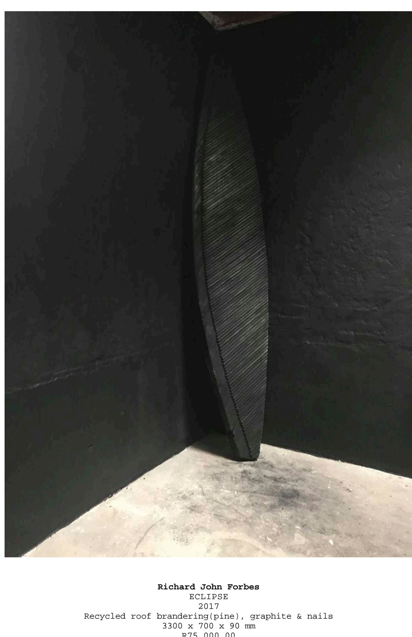
Richard John Forbes ECLIPSE 2017 Recycled roof brandering(pine), graphite & nails 3300 x 700 x 90 mm R75.000,00